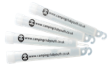
Glow Sticks £1.00 each