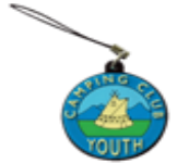
Phone Charm £2.00