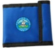
Ripper Wallet/Purse £4.00