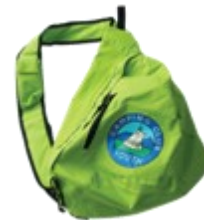
City Bag £7.00