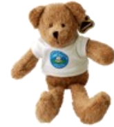
Scraggy 9" Bear £5.00